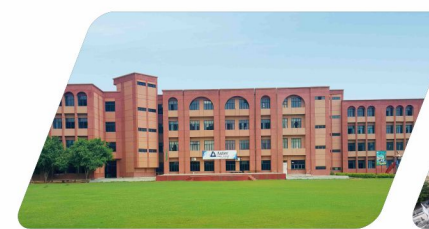
J-1, Delta-2, Greater Noida