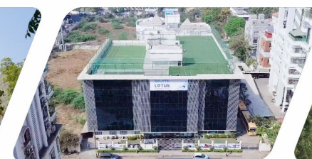
Vesu, Surat, Gujarat