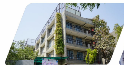
Mayur Vihar Phase-1, Delhi