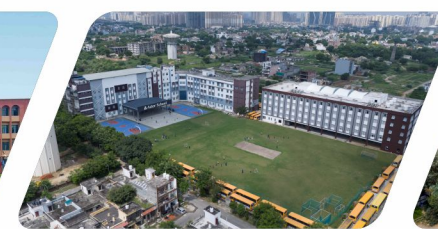
HS-1 & HS-4, Sector-3, Noida Extn.