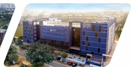
KP-5, Greater Noida